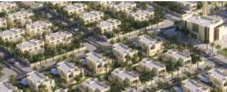
350 villas in Al Wathba residential complex

a silent impact, with a presence that never fades